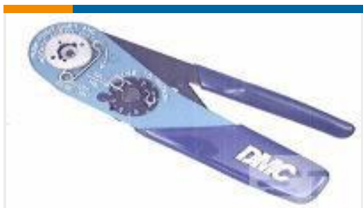
TE Part # 601966-1 CRIMPING TOOL M22520/2-01