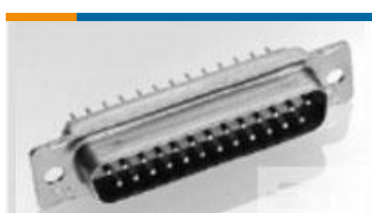
TE Part # 206500-1 PLUG ASSY,26 POSN,Sz2,AMPLIMITE