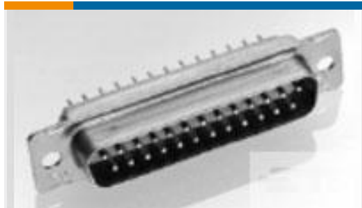
TE Part # 206063-2 PLUG ASSY,44 POSN,AMPLIMITE